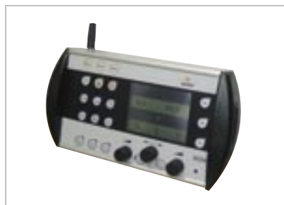
All changes of road surface temperature and spreading quantity are shown on the EpoMaster® IV remote control display on a continuous basis. A symbol for the selected weather type is shown at the bottom right of the screen display.

Hereafter the system adjusts the spreading quantity according to the selected weather type and to the road temperature.